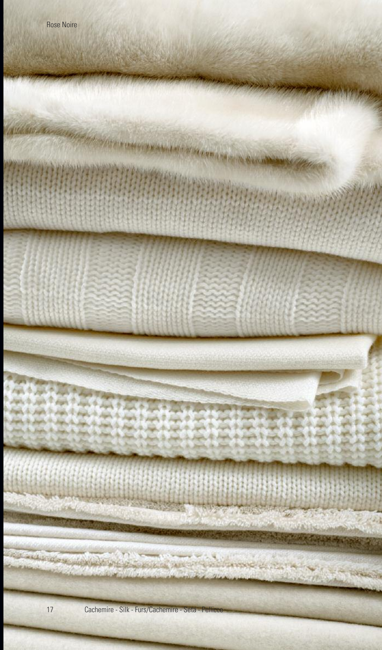
Plaid — Blanket Naïke 01, Simon-Cachemire dis. 2 col. 42, Bon Ton 01, Cachemire dis. 3 col. 42, Class 02, Vogue 01