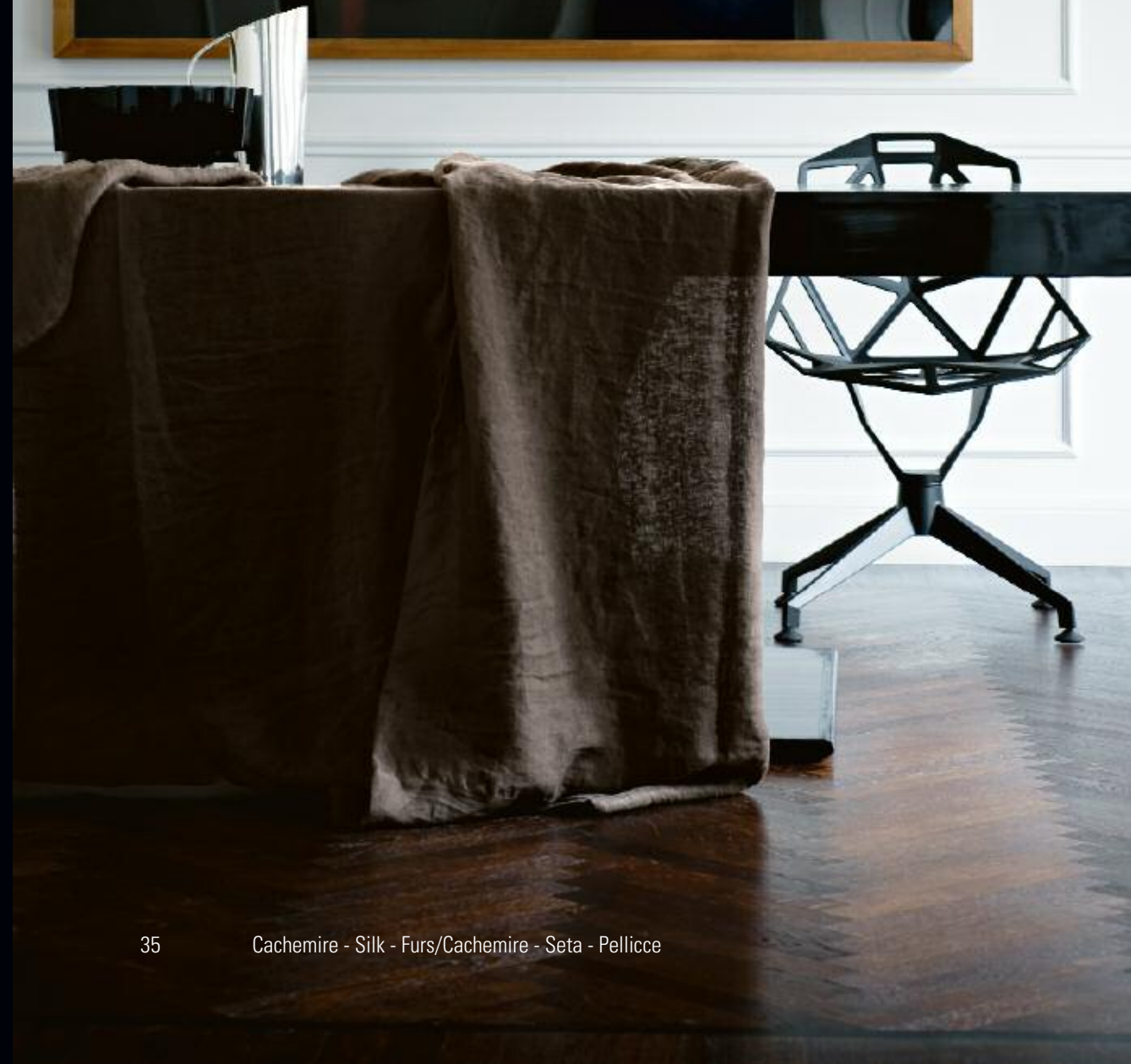
Tovaglia — Table cloth Sheidò 07