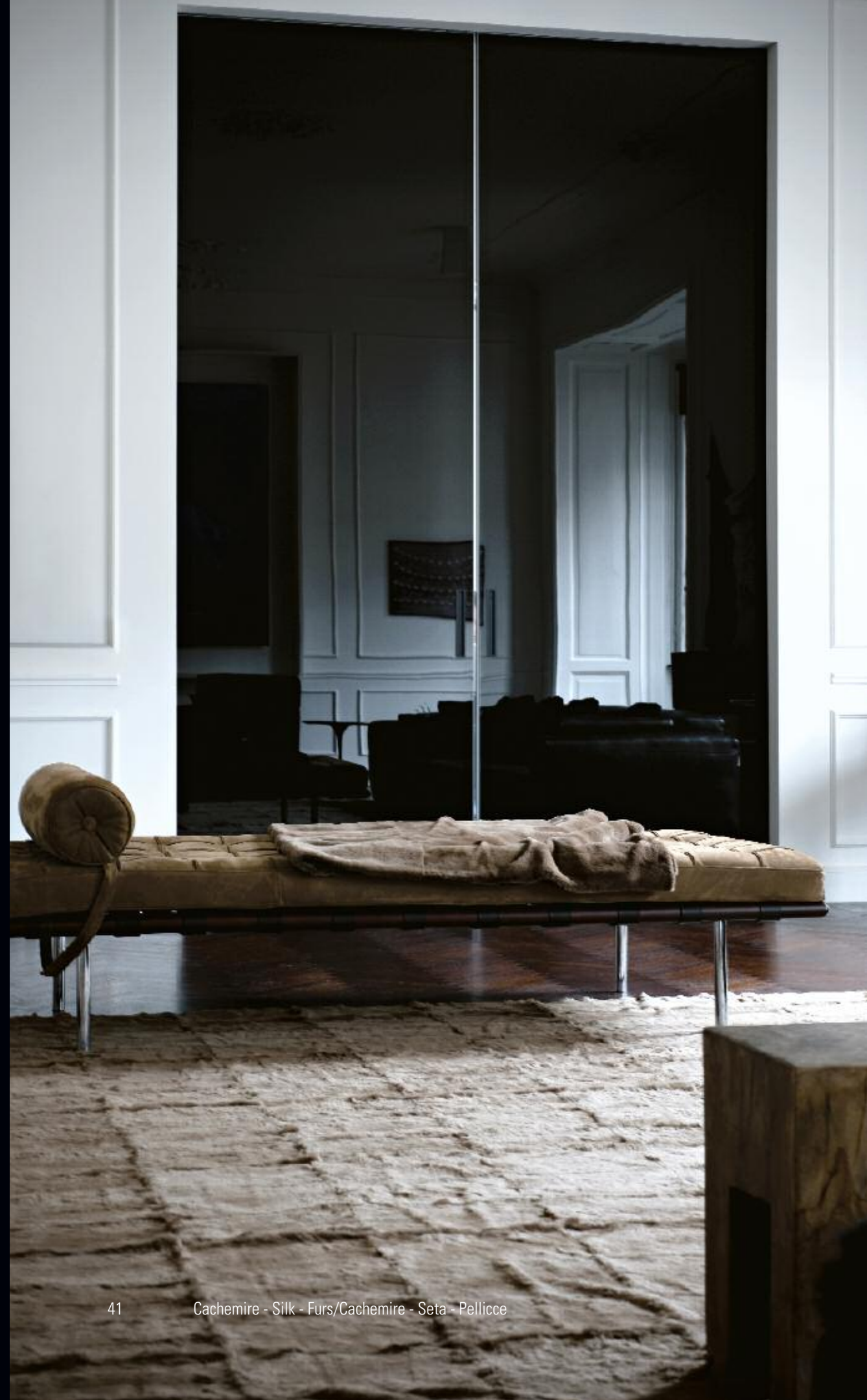
Tappeto — Carpet Clint 14 Plaid — Blanket Sensual Touch