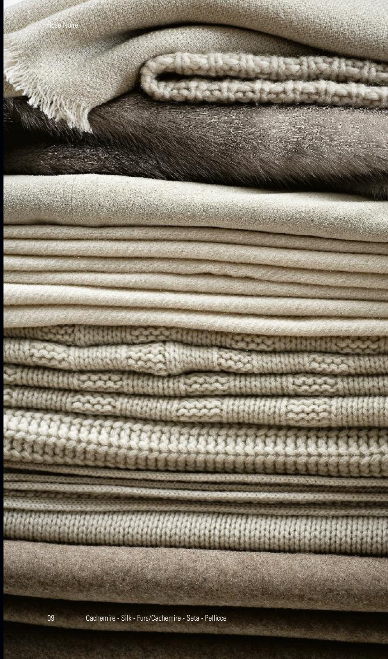
Plaid — Blanket Bon Ton 02, Cachemire dis. 3 col. 43, Naïke 02, Sablè 17, Class 01, Cachemire dis. 2-dis. 3 - Simon 43, Vogue 02