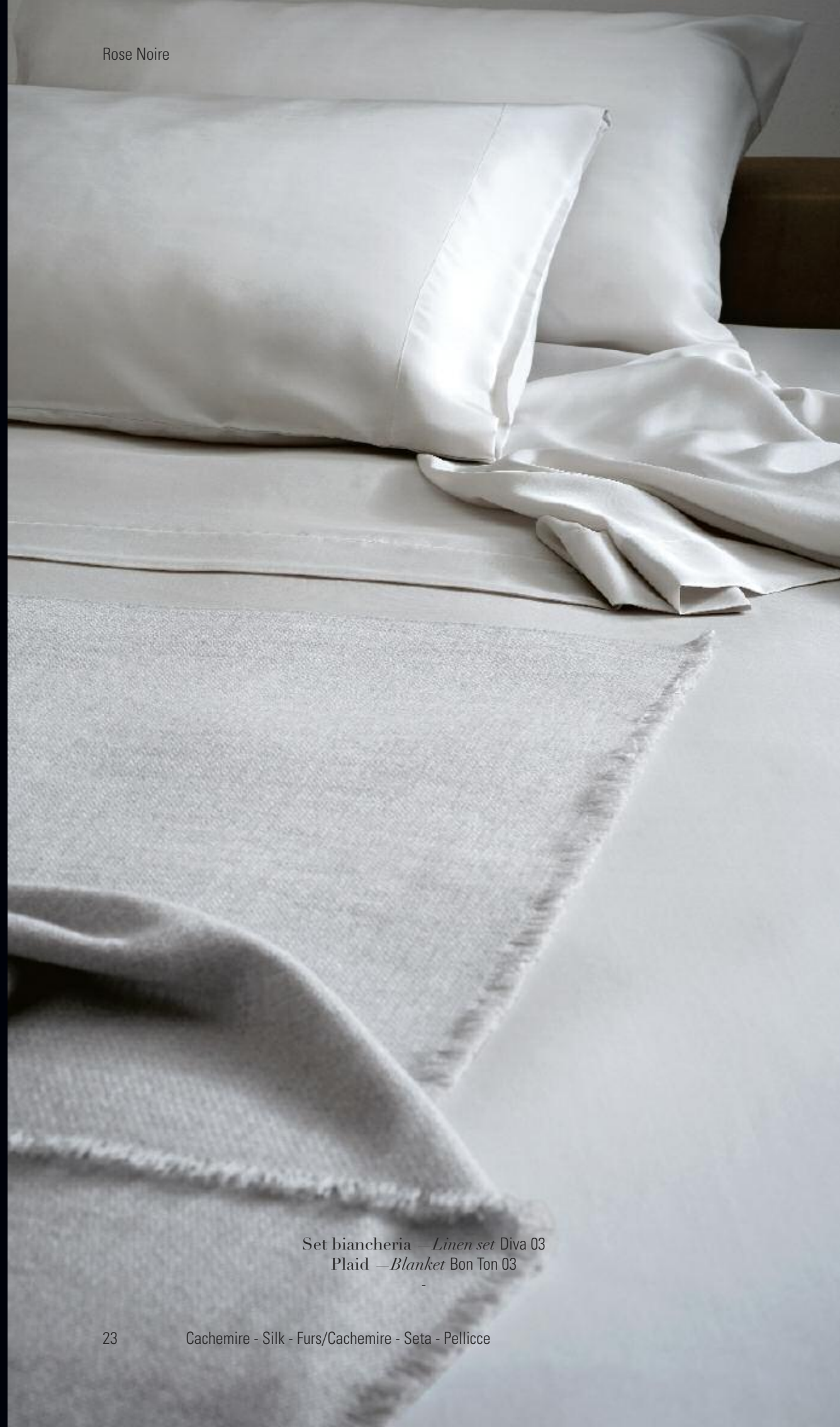
Set biancheria — Linen set Diva 03 Plaid — Blanket Bon Ton 03