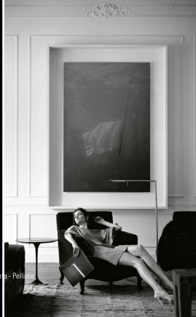
Tappeto — Carpet Clint Plaid — Blanket Sharon