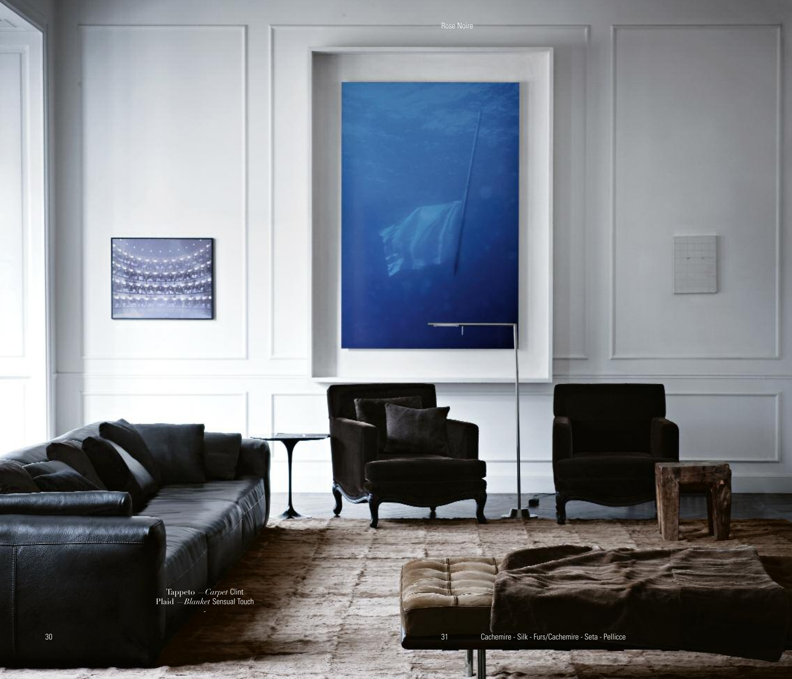
Tappeto — Carpet Clint Plaid — Blanket Sensual Touch