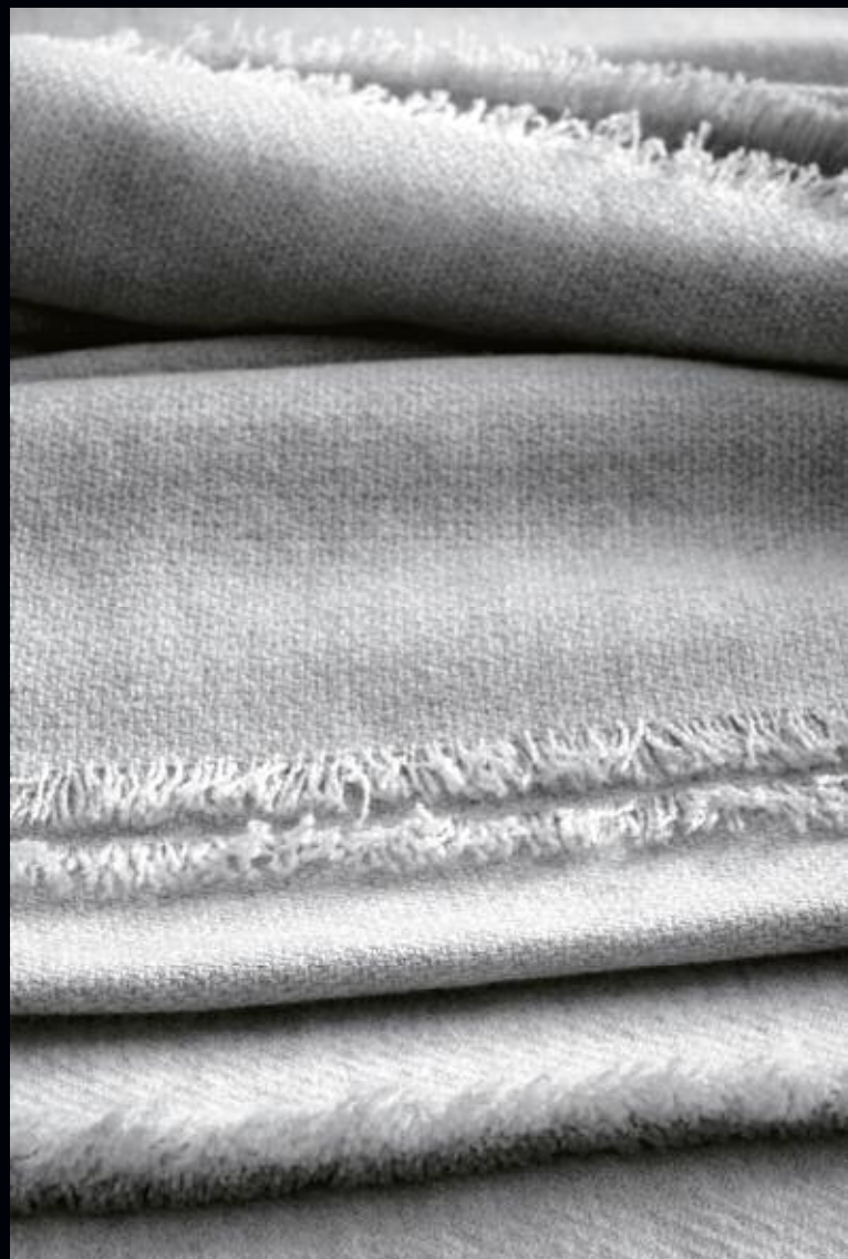
Plaid — Blanket Bon Ton 03, Class 02