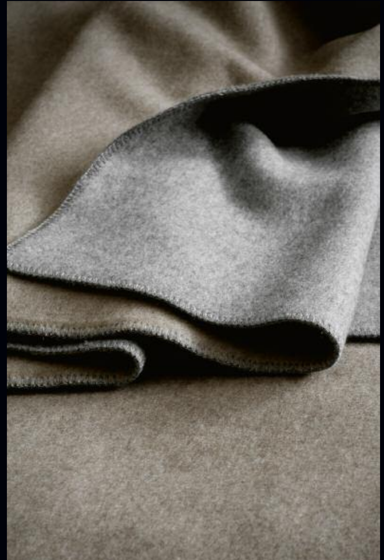
Plaid — Blanket Vogue 02