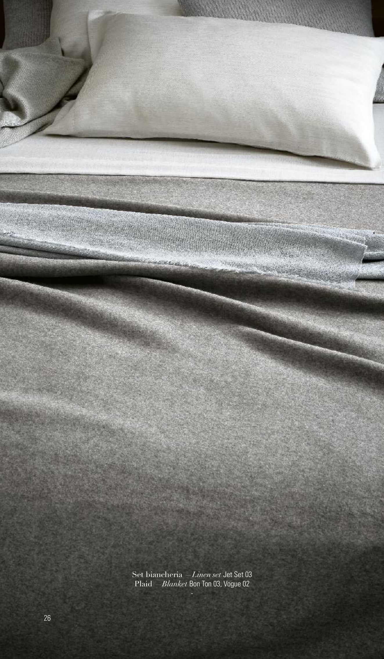
Set biancheria — Linen set Jet Set 03 Plaid — Blanket Bon Ton 03, Vogue 02